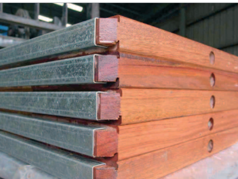
Hardwood production pallets from Antekad

Antekad has been taking its environmental and economic responsibilities seriously for many years, for example, by cultivating over 150,000 hardwood trees that they have planted in recent years. Because the wood is monitored whilst it is growing and given the required care and attention, Antekad makes an important contribution to the local economy. A total of over 200 staff work for Antekad. All the