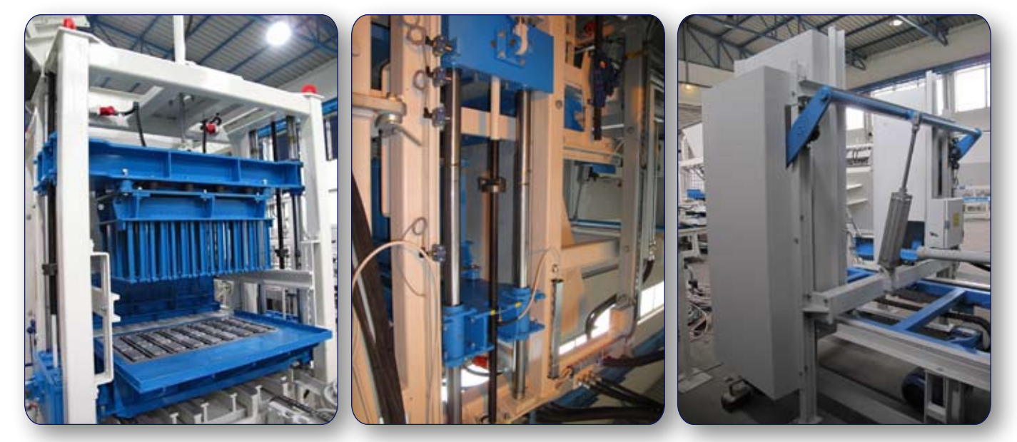
Tamper head bridge