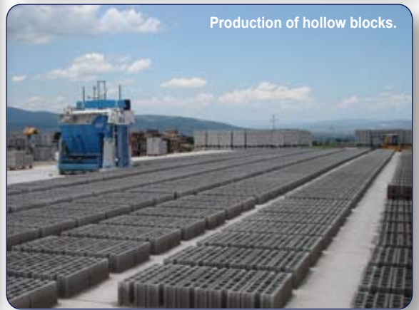
Production of hollow blocks.