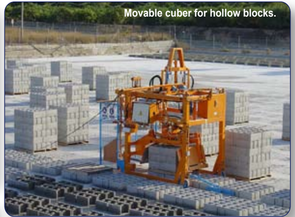
Movable cuber for hollow blocks.